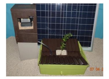
Figure 5 – Irrigation system for plants and trees that take the water from humidity of the air.

With the project Watering with the Humidity of the Air , the ESTC has built an irrigation system for plants and trees that take the water from humidity of the air, Figure 5.