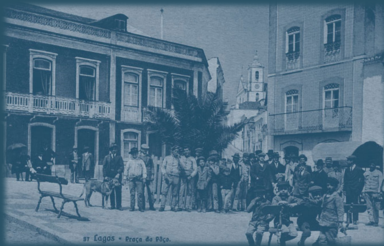
locals in a Lagos central square - c. 1915

«Here everyone knows each other and know each other's life. These qualities and defects are simultaneously the fascination of a small town turning into a cosmopolitan urbe.»