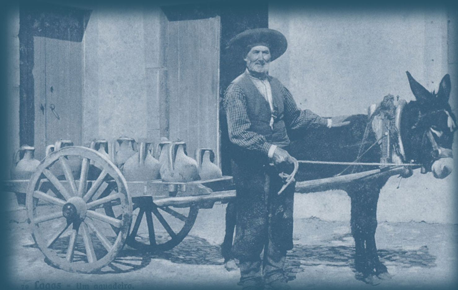
79 Lagos - Um aguadeiro. waterseller- c. 1920

A photo can show us the appearance of a waterseller from the early twentieth century, the clothing and the utensils used, his constitution and the apparent condition of his health; or a place, a building, a village, showing details that the written description often omits. And this is the essential information for understanding the path to present times.