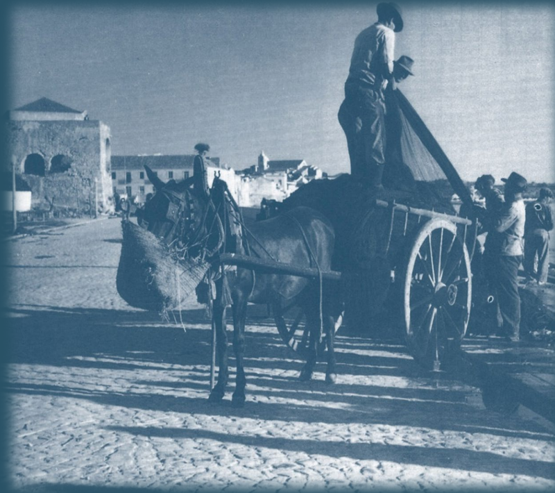
gathering fishing nets – late 40'

The duty of not forgetting is extendible to the entire historical legacy. The memory of what preceded us must be preserved. The memory is an intangible heritage. A photograph is also a memory.