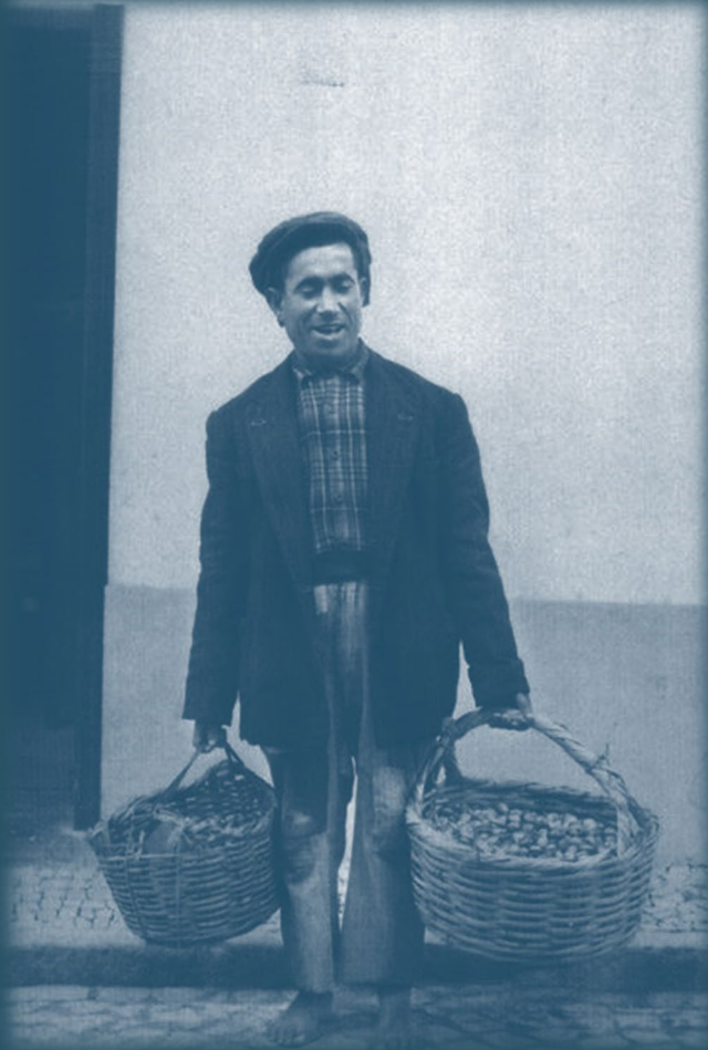
salling cockles - c. 1940

In the last quarter of the nineteenth century photos began to replace the written word and the image frees itself from the artistic feud and from the control of the elite. Photography is universalized.