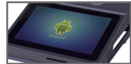
Capacitive Touch Panel