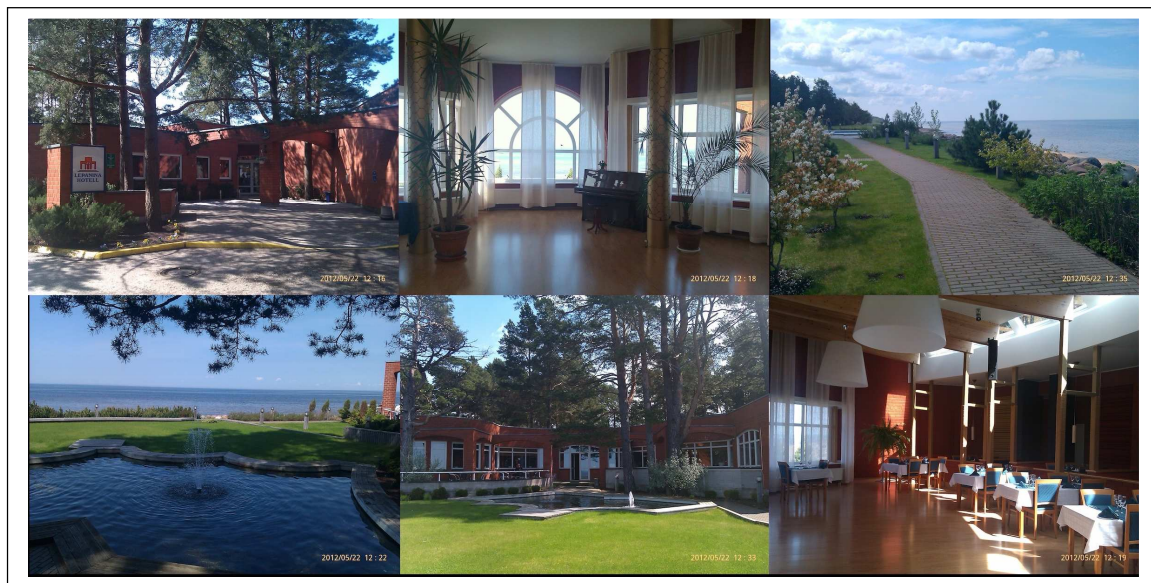
Figure 4. Example of private Estonian spa hotel (Lepanina Hotell) created on the Baltic Sea coast: a successful combination of modern European hotel design, location in the nearest proximity of the sea, maritime design landscapes, and coniferous forests makes it a valuable health resort area.

Currently, Estonia has intensive privatization process, which is caused by serious changes in state regulations on property and ownership. Naturally it caused intensification of construction of privately hold hotels and summer cottages, built both for personal (family based) needs for spending summer vacations, and for rent to incoming tourists, domestic and international. Land management system and urban development of Estonia significantly changed in the past 20 years, which reflects overall socio-economic and political situation in the country (Roose et al. 2012). Nowadays, suburbanization and development of second houses become the major and most evident processes in the current urban dynamics of modern Estonia (Palang and Peil, 2010).