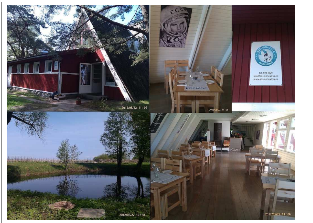
Figure 3. Interior and the surroundings of the Cosmonauts Hotel - a former Soviet summer resort for workers of space industry ( www.kosmonautika.ee ): applying space topic and cosmos theme in hotel: soviet cosmonaut Y.Gagarin who was the guest in this hotel.

The history of Pärnu resort goes back to the XIX century, when Estonia was under protection of Russian Empire. Domestic tourism in the Baltic Provinces including Pärnu, was largely connected with sea bathing during July month. The season always ended by August 1 due to the restricted climatic conditions (Kohl, 1842). During the First World War the development of the resort was largely restricted, though quickly revived after the war. In 1920s the Rannapark has been restored, and a new mud bath constructed, opened for tourists. In late 1920s - 1930s Estonian hotels and restaurants were one of the cheapest touristic destinations in Baltic Europe, which was advertised in the tourist literature of that time. The easy access to the Pärnu region was facilitated by good railway communication with Germany, Latvia, and Lithuania. As a consequence, this region was widely visited by various international guests with the majority of Scandinavians (e.g. Swedes, Finns), Poles, Germans and Brits (Worthington, 2003).