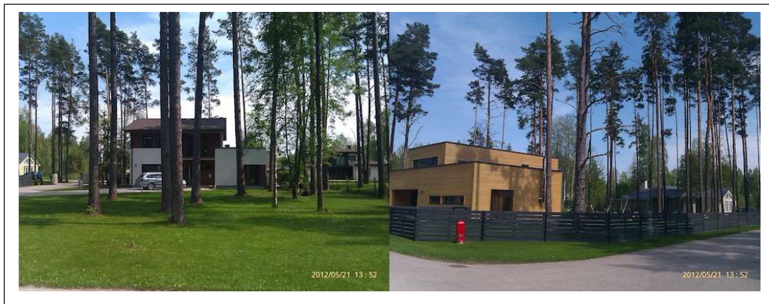
Figure 2. Example of rural environmental tourism: eco-style new cottages built since 1990s in Pärnu surroundings.

In general, Estonian touristic sector currently transforms a gradual functional shift away from authoritative style of tourism with common Soviet guesthouses towards capitalist privately held small hotels. Nowadays, some of former hotels naturally become a bankrupts or else depopulated and lost their tourism function completely. However, as justly recommended by Agarwal (2002), such decline may be avoided in case the counter-measures are accepted and used, such as re-orientation of the hotels towards environmental eco-friendly style, enhancement of the attractions for kids and sightseeings for adults, or even the repositioning of the destination within an overall touristic market.