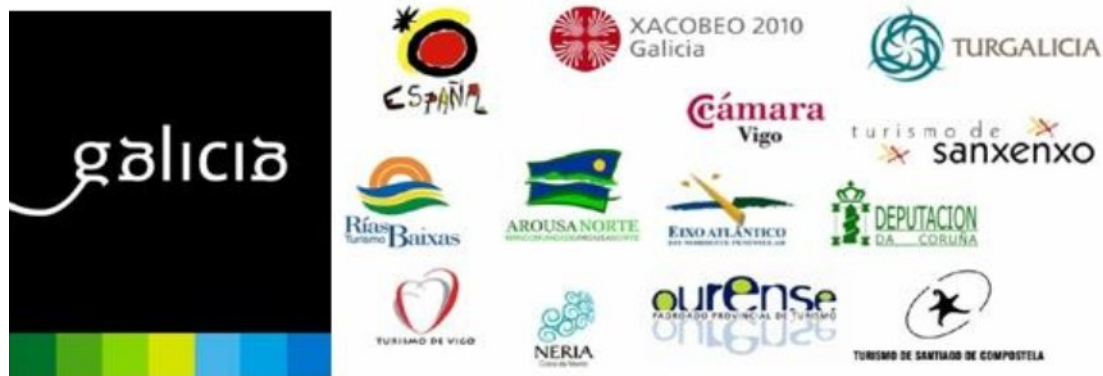
Example 1: Tourist logos of public and private entities in a state, autonomic, provincial and municipal scale.

1. In the marketing process of the territory as a tourist product, the government, private companies and residents, either individually or collectively, design a specific identity. This brand identity should be the result of consensus and cooperation among the different actors involved in the marketing strategy. However, this does not happen in the case of Galicia. The conflict of responsibilities and difficulties, to join efforts, among different governments (local, regional, autonomous) makes the projection of a clear identity in the international market impossible. I believe that the existence of different political interests impedes a unification of efforts in the same direction or the achievement of the same goal. For example, the differences of political opinions in Galicia among councils, provincial councils, chambers of commerce, regional administration, state government and the European Union about the airports policy is locking the growth and competitiveness of Galicia as a major flying destination. The same problem is found when defining the brand image and identity of Galicia as tourist destination.