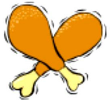
FRIED CHICKEN .....