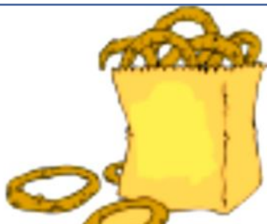
ONION RINGS .....